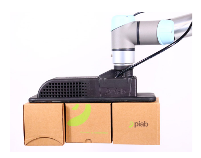
By enabling multipicking of boxes, the CPT enables \, palletizing processes to reach a new level of efficiency.