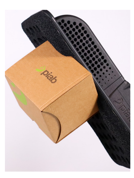
No matter, at which angle you have to move the boxes - the powerful COAX® equipped CPT holds on to them safely and securely.