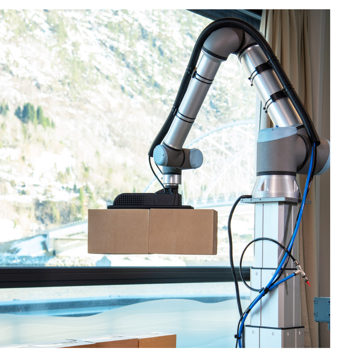
Get more pallets packed and shipped a day or reduce the speed of your cobot to increase its lifetime. The choice is yours!