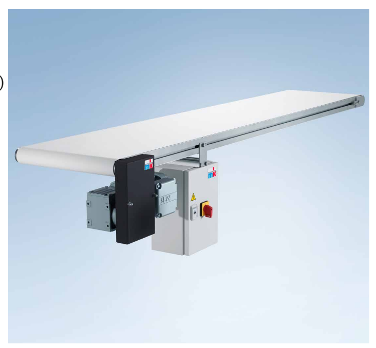
GUF-P 2000, AC head drive 250 W, optional with frequency inverter

The frequency inverter is used for the power supply and control of the motor and meets, with motor protection and a main switch, the requirements of the Machinery Directive for a complete machine. The regulation for 4 fixed speed levels, including soft start and reversing operation, as well as start/stop control is carried out via a 24 V DC interface. It is completely installed in a separate IP54 control cabinet and is wired ready for connection. The supply voltage (230V AC/50 Hz/16A) and signals are provided with plug connections for direct connection to the main cabinet.